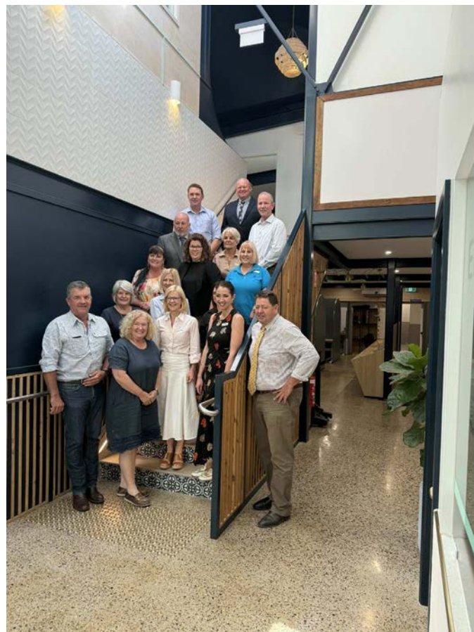
BROC members at a recent Moree meeting.

Another major topic is the ongoing Inland Rail project. The meeting was presented with an update which outlined Inland Rail's plans to enhance national freight capacity, reduce road congestion and emissions, and improve regional connectivity by linking Melbourne to Brisbane via Parkes, Narromine and Toowoomba. Inland Rail is progressing construction between Beveridge and Parkes, with completion south of Parkes expected by late 2027.