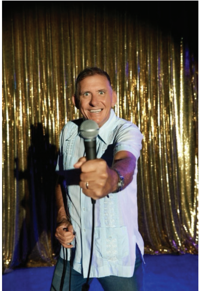
Famed funny man Peter Rowsthorn will perform in Delungra on 19 October.

Fittingly, Muster Up Delungra recently spent some of their