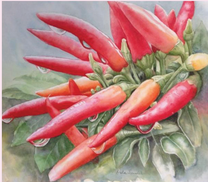
Hot Chillies , 50 x 42cm, watercolour - $320 Nola Sindel

2024 Triennial Travelling Quilters Challenge Winners announced!